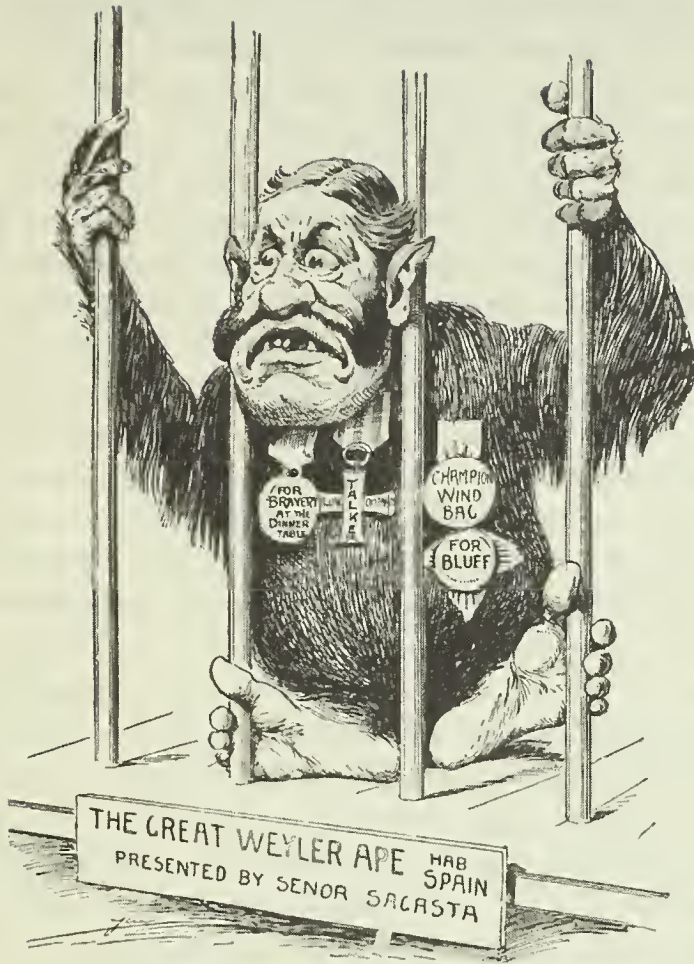
Would make an excellent addition to our museum —Philadelphia Inquirer.

No Spanish governor-general of Cuba was ever so thoroughly hated and detested as Weyler. The above picture, representing him as an ape, is probably the most expressive form in which public contempt for him could have been shown.